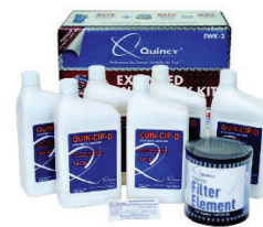
EWK Kit - 3 / Quin-Cip D