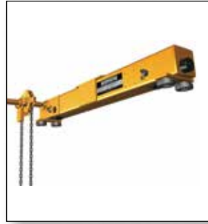
Series 3 Geared End Trucks Top: 1 – 5 Ton Underhung: 2 – 5 Ton