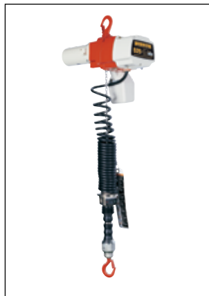
ED-DA Series Electric Hoists 1-Phase Dual Adjustable 125 – 525 Lbs.