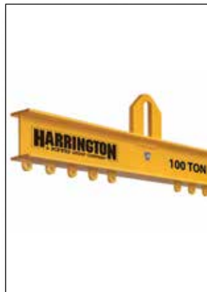
Below-The-Hook and Material Handling Equipment