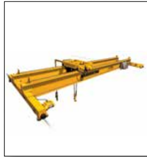
Series 3 Complete Cranes Double Girder Motorized or Geared Top or Underhung