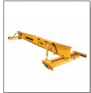
HPC Series Complete Cranes Single Girder Push Top or Underhung