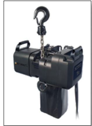
TNER Theatrical Series Electric Hoists 3-Phase 1/2 – 2 Ton