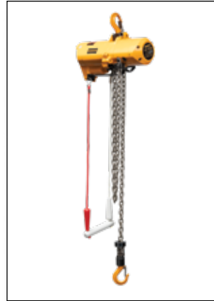
TCL Series Lube Free Air Hoists Cord or Pendant Control 1/4 – 6 Ton