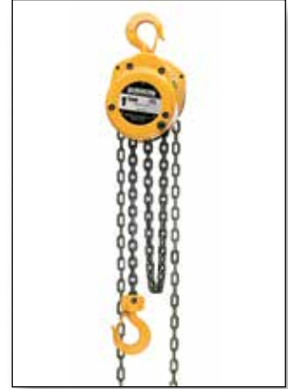
CF Series Hand Chain Hoists 1/2 – 5 Ton