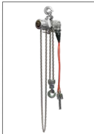
TCW Series Lube Free Wash Down Air Hoists Cord or Pendant Control 1/2 – 1 Ton