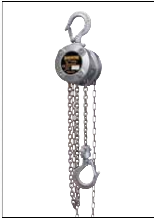
CX Series Mini Hand Chain Hoists 1/4 – 1 Ton