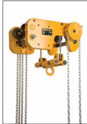
SHB Series Ultra-Low Headroom Hand Chain Hoists Geared Trolleys 1 – 10 Ton