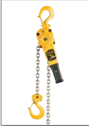
LB Series Lever Hoists 3/4 – 9 Ton