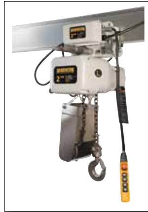
NERM-FG Series Food Grade Electric Hoists Electric Trolleys 3-Phase 1/4 – 2 Ton