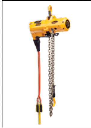
TCS Series Air Hoists Cord or Pendant Control 1/4 – 1 Ton