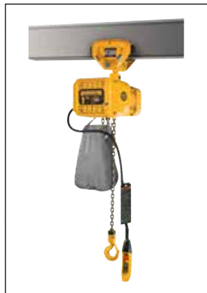
(N)ERP Series Electric Hoists Push Trolleys 3-Phase 1/8 – 10 Ton