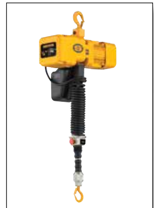
(N)ER-CC Series Electric Hoists 3-Phase Cylinder Control 1/8 – 1/4 Ton