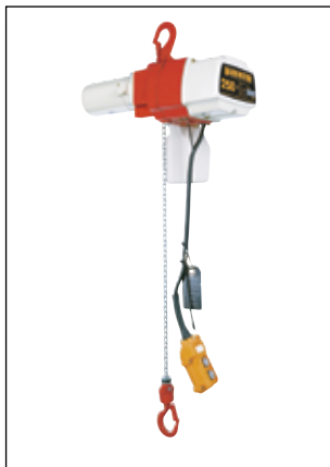
ED-V / DS / DSA Series Electric Hoists 1-Phase Single/Dual Speed 125 – 1,050 Lbs