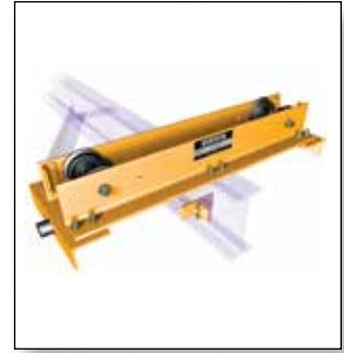
HPC Series Push End Trucks Top or Underhung Convertible 1/2 – 2 Ton