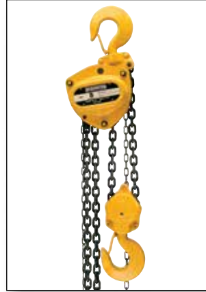
CB Series Hand Chain Hoists 1/2 – 100 Ton