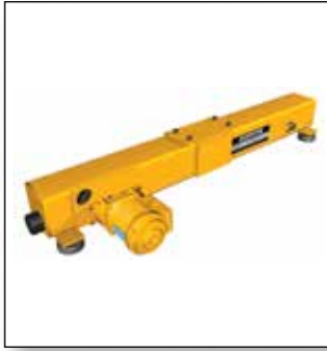
Series 3 Motorized End Trucks Top: 1 – 10 Ton Underhung: 2 – 5 Ton