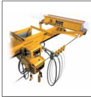
Series 3 Complete Cranes Single Girder Motorized, Push or Geared Underhung