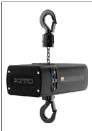
TEM/SEM Series Electric Hoists 3-Phase & 1-Phase 500 – 1000 Lbs.