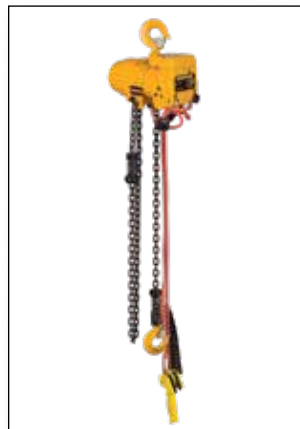
TCR Series Air Hoists Cord or Pendant Control 1/4 – 25 Ton