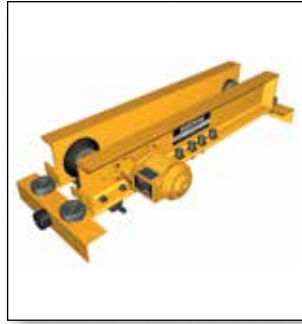
Series 3 Push End Trucks Top: 1 – 5 Ton Underhung: 2 – 5 Ton