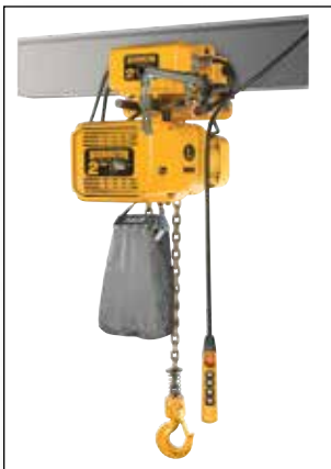
(N)ERM Series Electric Hoists Electric Trolleys 3-Phase 1/8 – 20 Ton