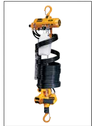
AH Series Air Hoists Manipulator Control 250 – 500 Lbs..