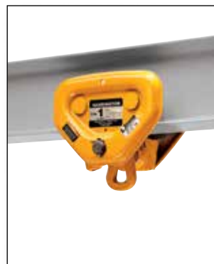
PT Series Push Trolleys 1/2 – 10 Ton