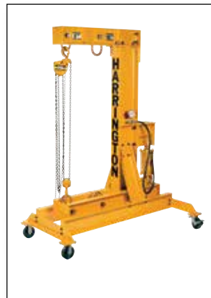
SHLT Series (Static) DHLT Series (Dynamic) Hoist Load Testers 1/8 – 10 Ton