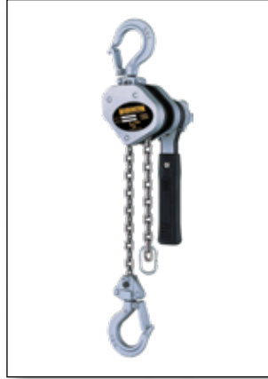
LX Series Mini Pullers 1/4 – 1/2 Ton