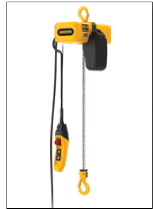
SEM Series Electric Hoists 1-Phase 500 – 1000 Lbs.