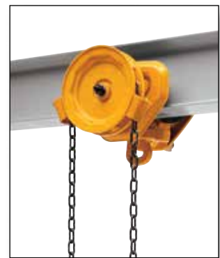
GT Series Geared Trolleys 1/2 – 20 Ton