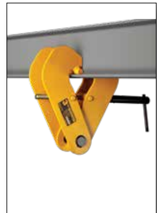
Universal Beam Clamps 1 – 10 Ton