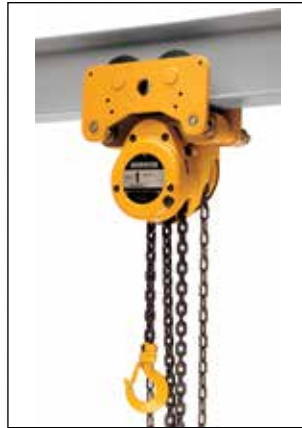
NTH Series Low Headroom Hand Chain Hoists Push Trolleys 1 – 5 Ton