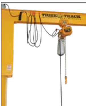
Tiger Track Jib and Gantry Cranes