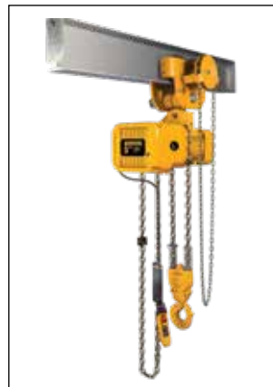
(N)ERG Series Electric Hoists Geared Trolleys 3-Phase 1/8 – 20 Ton