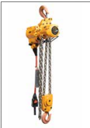
TCE Series Air Hoists 1/4 – 6 Ton