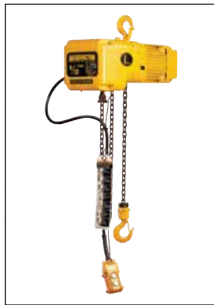
SNER Series Electric Hoists 1-Phase 1/4 – 3 Ton