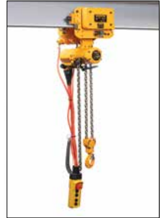
TCLM Series Lube Free Air Hoists Air Trolleys Pendant Control 1/4 – 6 Ton