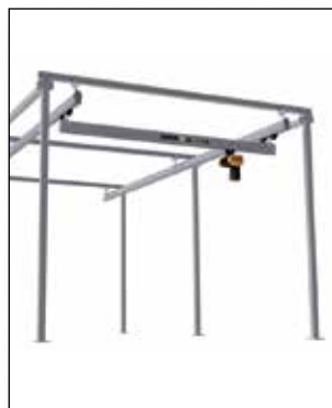
Tiger Track Workstation Cranes