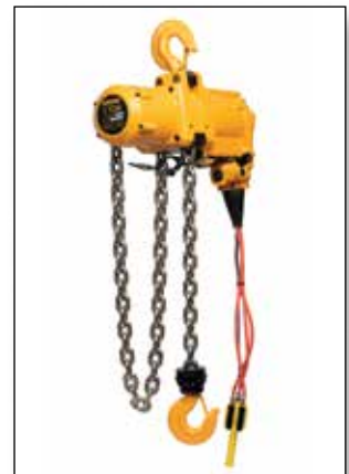
TCK Series Air Hoists Cord or Pendant Control 3 – 6 Ton