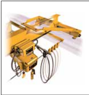
Series 3 Complete Cranes Single Girder Motorized, Push or Geared Top