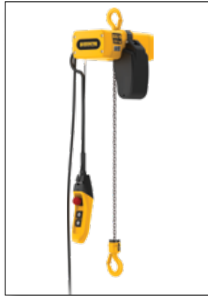
EM Series Electric Hoists 3-Phase 250 – 1000 Lbs.