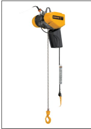
EQ/SEQ Series Electric Hoists 3-Phase & 1-Phase 1/8 – 1 Ton