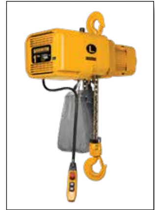
(N)ER Series Electric Hoists 3-Phase 1/8 – 20 Ton