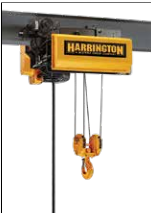
RY Series Electric Wire Rope Hoists Electric Trolleys Ultra-Low Headroom 3 – 10 Ton