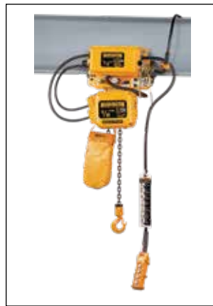
SNERM Series Electric Hoists Electric Trolleys 1-Phase 1/4 – 3 Ton